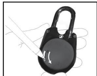
6. Slide the reset lever back to the "down" position.